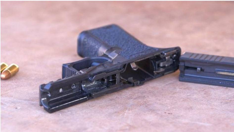
Ghost guns have to be assembled

Hamilton showed us several different ghost guns. Many had come off the streets. They recently confiscated 46 in a raid at a single home.