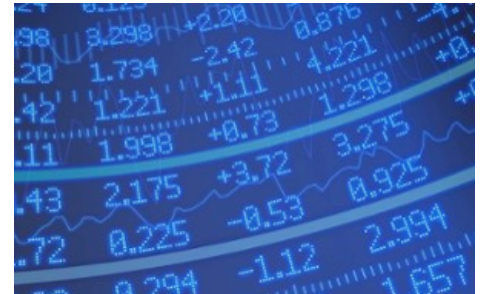
Sponsored by Charles Schwab