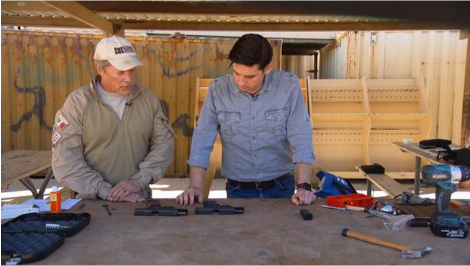
CBS News got a ghost gun online and assembled it within a few hours

Countless websites offer so-called ghost gun kits for everything from handguns to AR-15s and AK-47s.